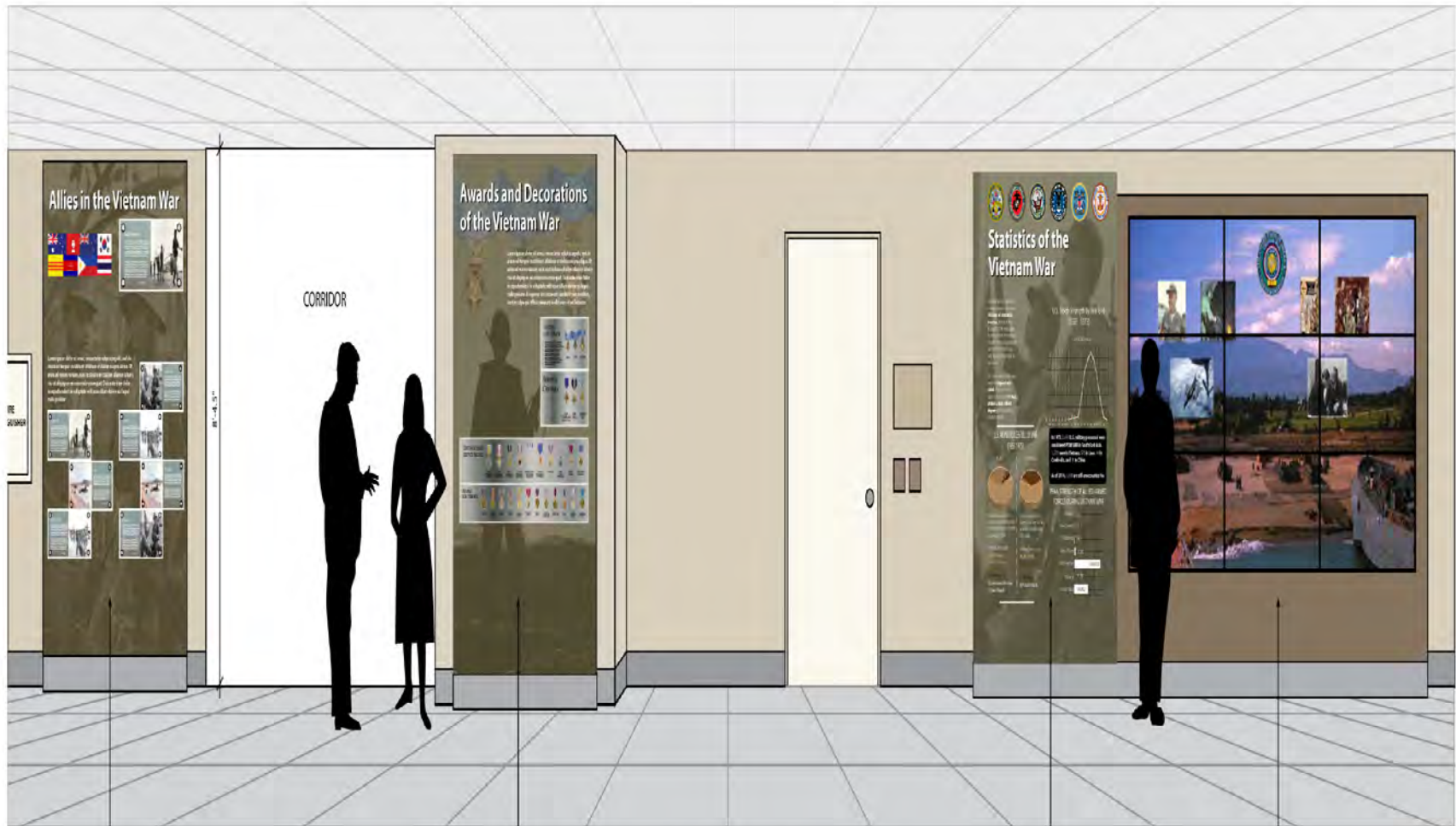
Exhibit panel highlighting Allied Nations during the Vietnam War